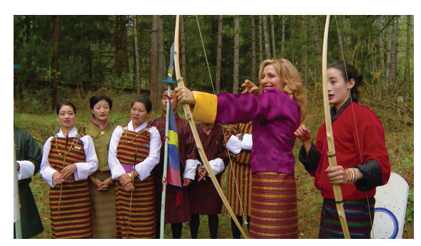
A tourist trying her luck on the game of archery in Bhutan with a traditional bamboo made bow and arrow

Like other sporting events, it is also played for 'the best of three' and whichever team reaches the total point of 25 first is the winner of the game and the team winning 2 games out of 3 is the winner of the match.