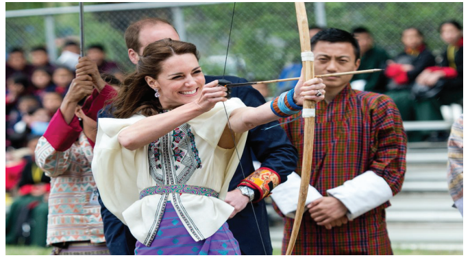
Kate, the Dutchess of Cambridge (UK) tries her best hand at archery during the recent Royal Visit to Bhutan

The game is played between 2 persons or 2 teams for a day or more, either for pleasure or during the tournaments. Each archer shoots a pair of arrow in turns and try to showcase the best skills to hit the targets placed in straight-lines at two extreme opposite-ends of the archery range measuring 145 m between two targets. The targets are made of the soft wood which approximately measures 2x1 feet (LxB), and they are decorated with colorful flags for better visibility.