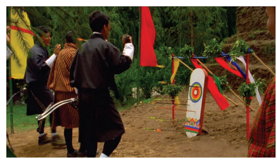
A team of archers dancing to celebrate a hit on the target by a team-mate

Whenever, a player of the team hits the target, rest of the team members dance & sing a dedicated archery song to celebrate the hit and counts the points. A hit on the target is called 'Karey' with 2 points and a hit on the bull's-eye without touching the circle is counted 3 points.