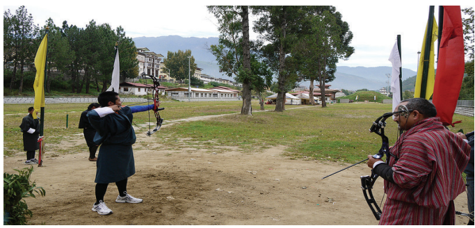
An archer is taking aim on the target & shooting the arrow

Archery is the national game of Bhutan played during the New Year celebrations and at happy occasions. It's very popular among the Bhutanese of all ages and even woman can play if they wish to do so. Normally, the men play the game and women enjoy dancing traditional songs & picnicking at the archery range for whole day with their family, friends & special invitees.