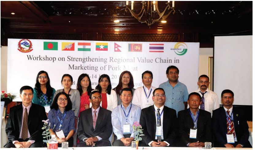
Delegates from the BIMSTEC Member States to the Workshop on Regional Value Chain in Marketing of Pork Meat

Delegates from BIMSTEC Member States i.e. Bhutan, Myanmar, Nepal, Sri Lanka and Thailand participated in the Workshop.